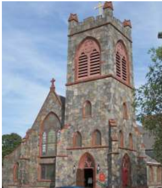
St. Paul's Episcopal Church 50 Park Place • Pawtucket, RI • 02860